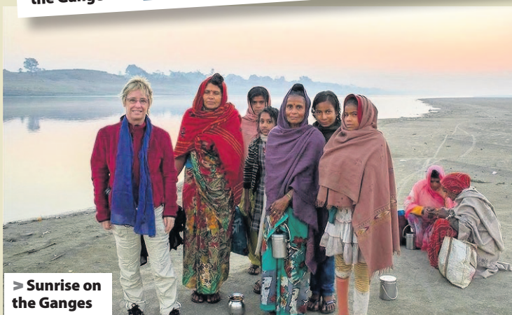
> Sunrise on the Ganges