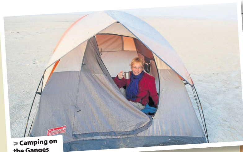
> Camping on the Ganges

WHO WHAT WHERE WHEN: Guy Fawkes; The Meat Purveyors; Off the coast of Sierra Leone in the North Atlantic Ocean; 1977 REMEMBER WHEN: 1970 IMPOSSIPUZZLES: Girl, 12 years old WORDWISE: C WHO AM I: Dorothy Stratten 10 QUESTIONS: 1 Consett, 2 Pig, 3 Eight, 4 Slovenia, 5 George Michael, 6 San Andreas, 7 Terence Conran, 8 Michelle Pfeiffer, 9 1950s (1953), 10 Antacid